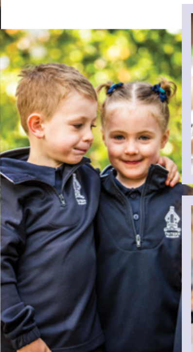
EARLY LEARNING CENTRE (Ages 3 – 5)