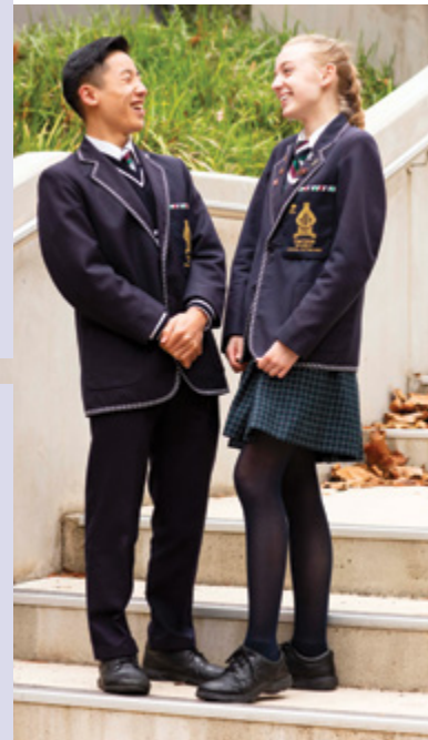
SENIOR SCHOOL (Years 10 – 12)

Our classes run on both co-educational and single gender settings according to the student’s age and stage. In the Early Learning Centre, our students begin their learning in a co-educational environment. From Prep to Year 9, our students learn in single gender classes at an age when gender tends to play a greater role in influencing learning styles. This allows us to tailor our teaching methods to create optimal learning and pastoral environments to support each child. Our students feel more confident to be academically courageous and challenge themselves in a supportive and nurturing environment.