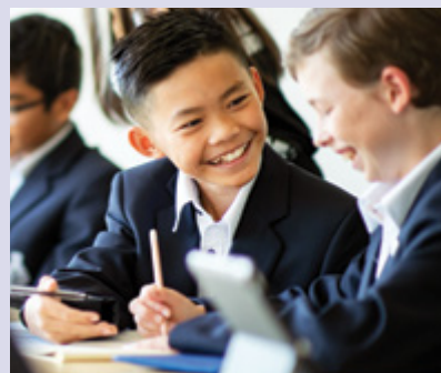
MIDDLE SCHOOL (Years 7 – 9)