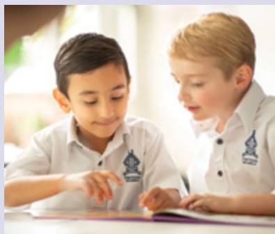
JUNIOR SCHOOLS (Prep – Year 6)